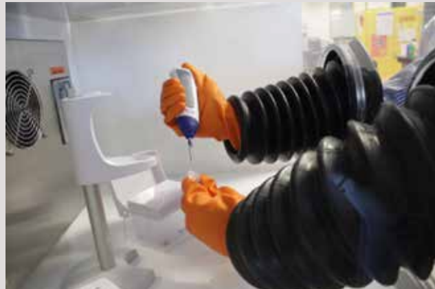
In Sterile Environment